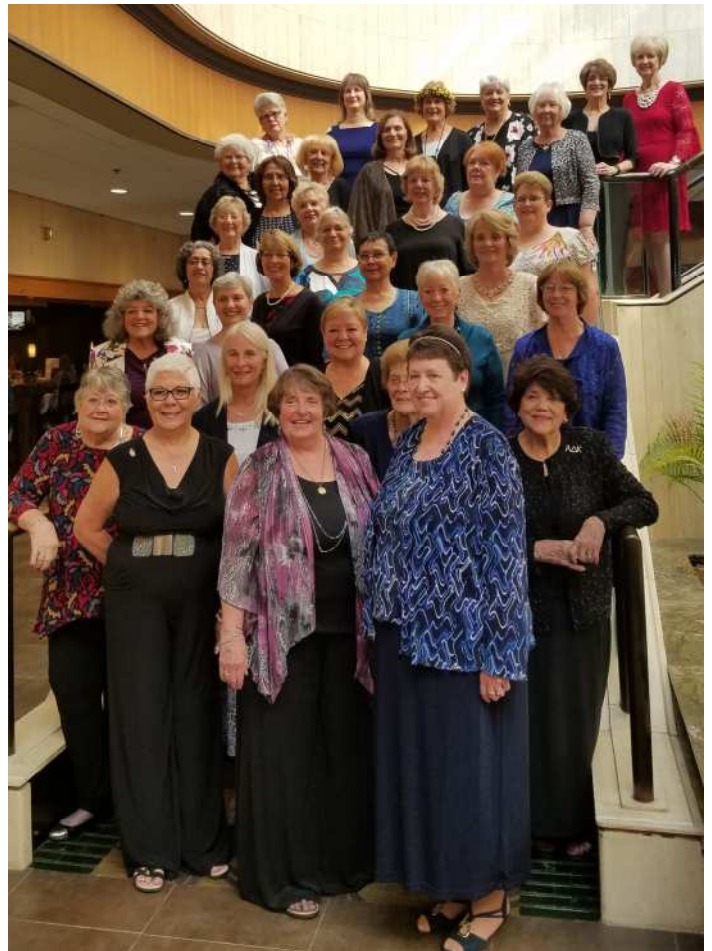
Our Arizona Sisters!

Thank You All for Making this Conference so Memorable!