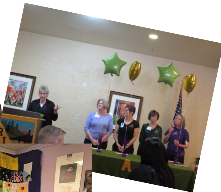
↑ Sigma Chapter Founders' Day Presentation — M and M's