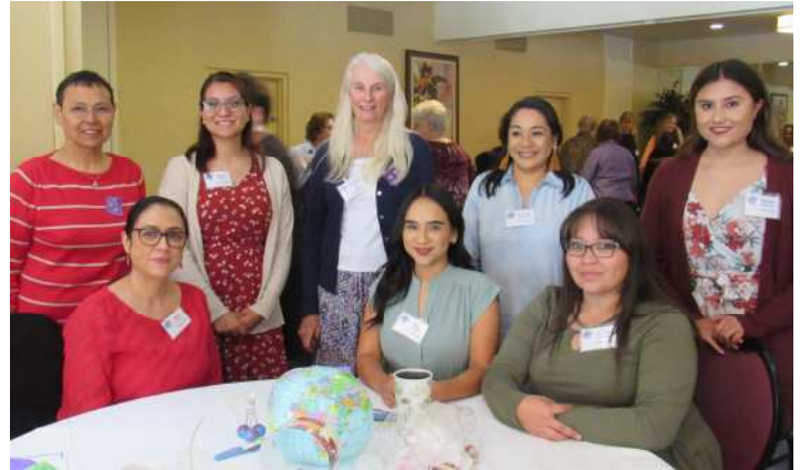
Photo of Club Organizers, Advisor, and Students from right to left: