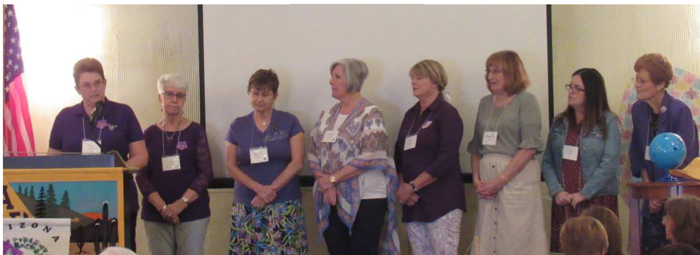
Theta Chapter Founders' Day Presentation