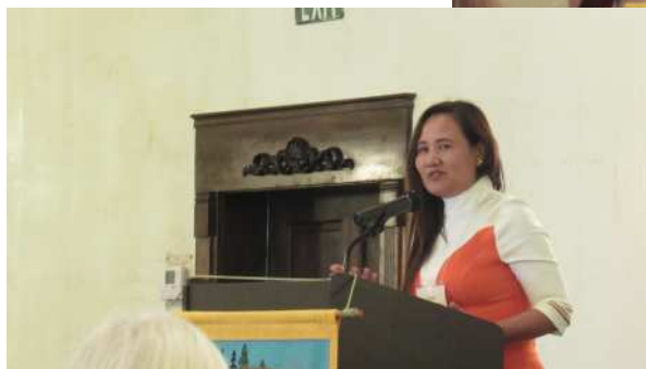
World Understanding Presentation — IOTA member—teacher from the Philippines